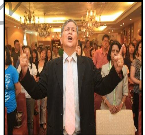
Through the storms. He is Lord. LORD of All. Glory to His Name. 经历过风暴。祂是主。万主之主。 荣耀归祂名