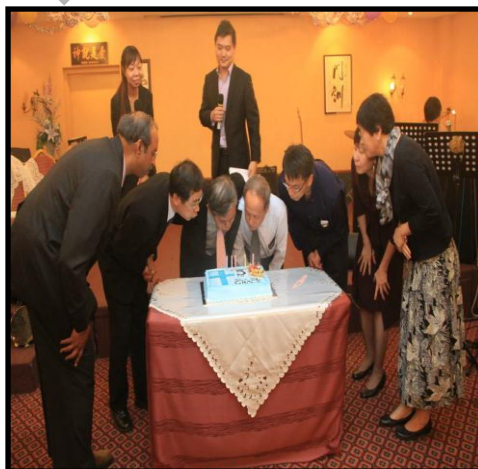
BLESSED BIRTHDAY TO CHURCH OF PUNGGOL SENKANG 祝福榜鹅盛港教会生日蒙福