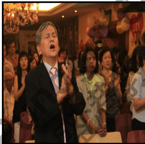
CHRIST ALONE, CORNERSTONE 唯靠基督, 房角石