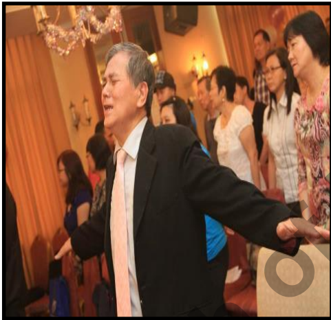
I dare NOT trust the sweetest frame but wholly trust in Jesus' Name 我不敢依靠那诱人的名誉， 乃要信靠耶稣之名

最后，榜鹅盛港教会从这里如何再次出发？我们是否晓得上帝要如何建立榜鹅盛港教会呢？榜鹅盛港教会还能持续多久？我们是否晓得该怎么做和如何带领上帝的百姓？当我们继续在榜鹅盛港扩展上帝的国度，榜鹅盛港教会接下来几年将面对这些挑战。我们对以上的问题没有答案！但有一事我们知道 - 那呼召我们的主是永远信实的，祂不会失败因祂是上帝。全靠祂的恩典，我们以感恩的心庆祝了五个蒙福的事工年份。Aiden Wilson Tozer 或 A.W.Tozer 曾经说过这些话，我们的五周年感恩庆会借用了他的话语“恩典 - 乃是上帝的喜悦并促使祂赐益处与那不配得的人”。全荣耀归于上帝。